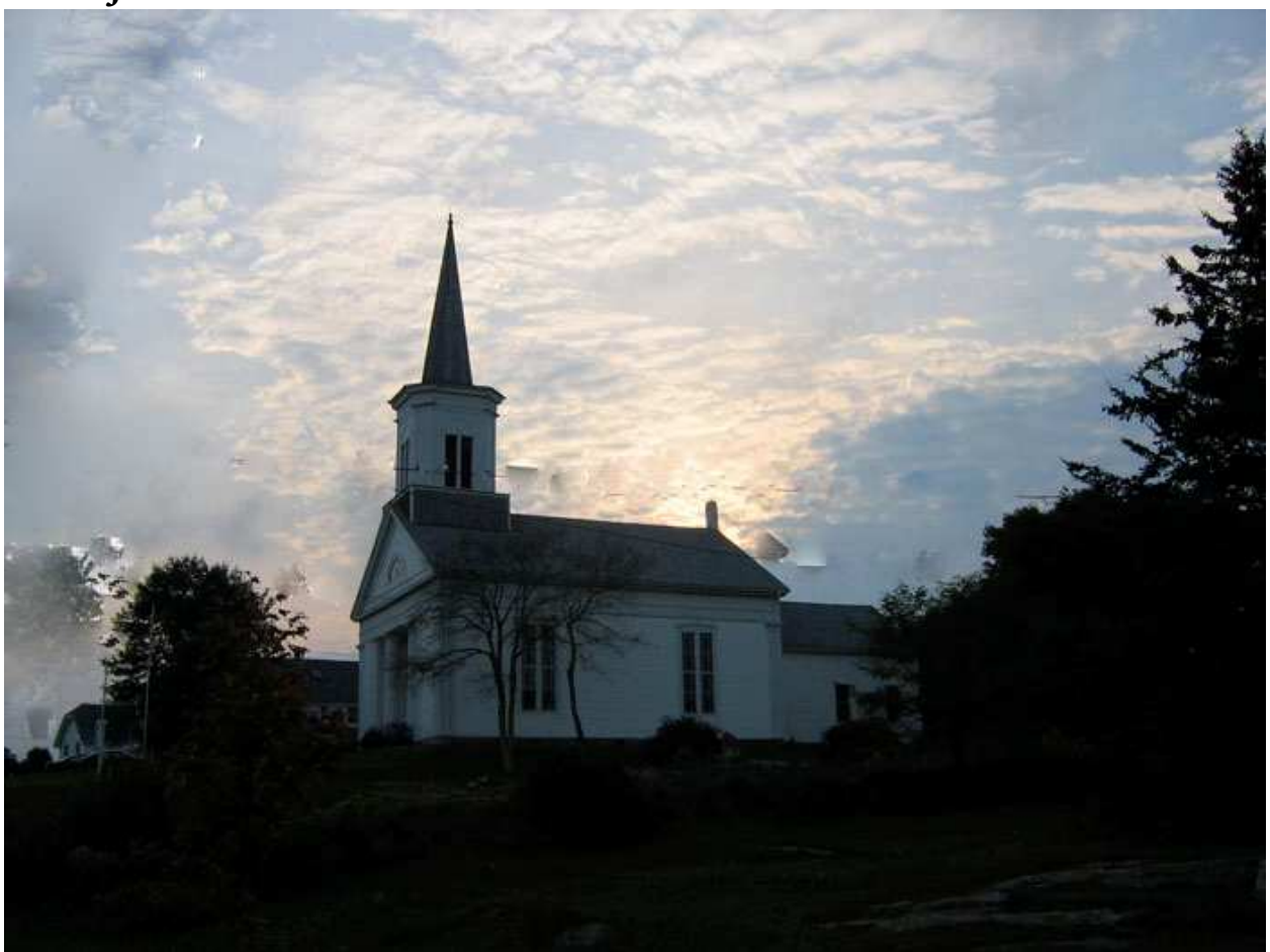
Canon A80 Steeple Church Portland Maine First the truth, then the SPIRIT of freedom & liberty will soar again. "Resistance to tyranny is obedience to God"